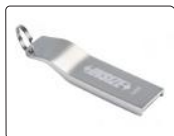
software flash disk (included)